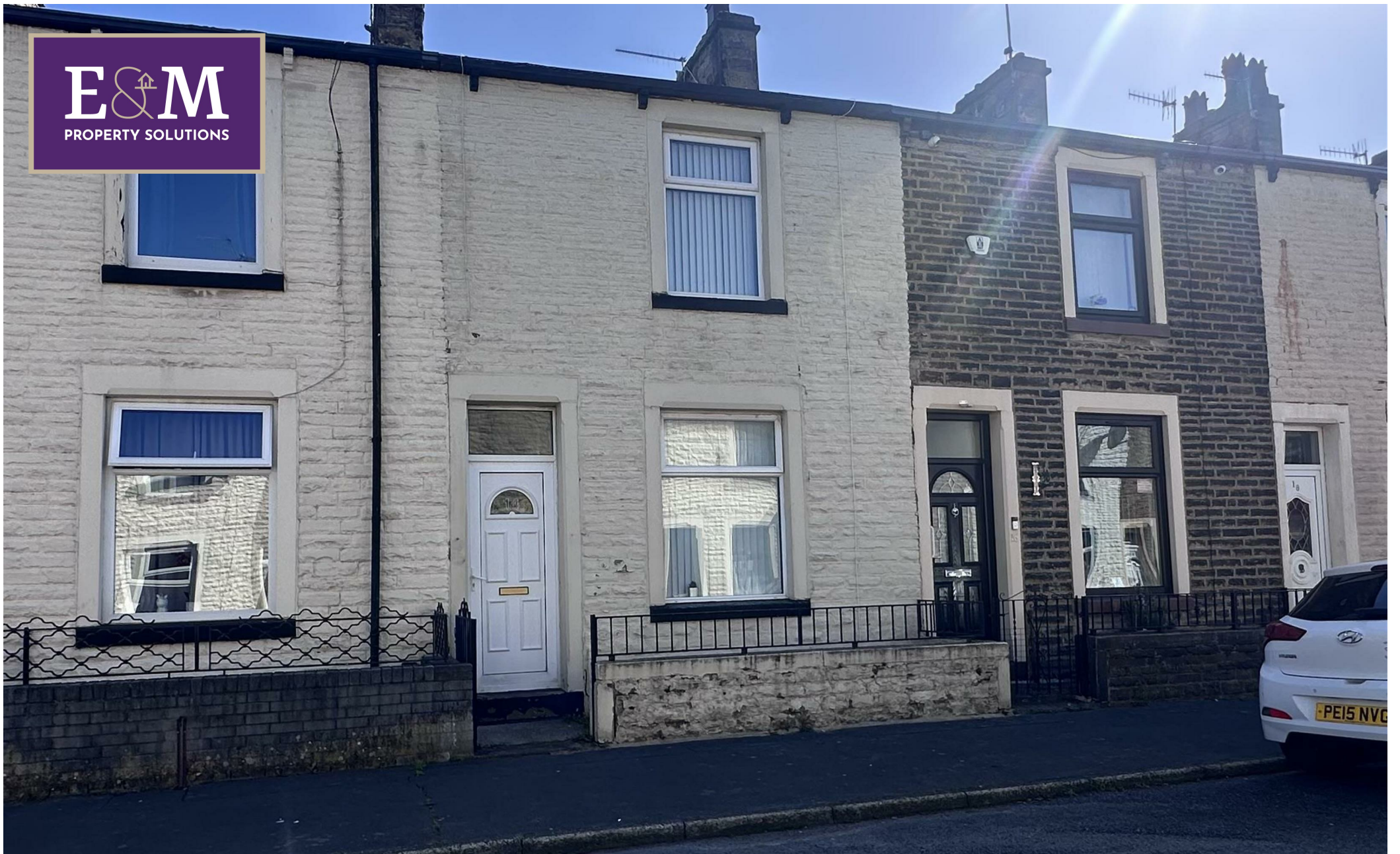
14 Lebanon Street, Burnley, Lancashire, BB10 4DF Asking price £120,000